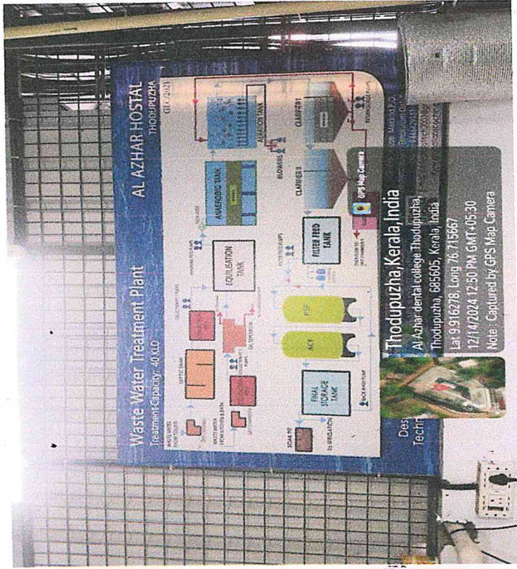
COLLECTION PIT -STP IN AADC BOYS HOSTEL

Thodupuzha, Kerala, India Al Azhar dental college Perumpilichira, Thodupuzha - Ezhalloor Rd, Thodupuzha, Kumaramangalam Part, Kerala 685605, India Lat 9.97166° Long 76.7162248° 14/12/24 11:20 AM GMT +05:30