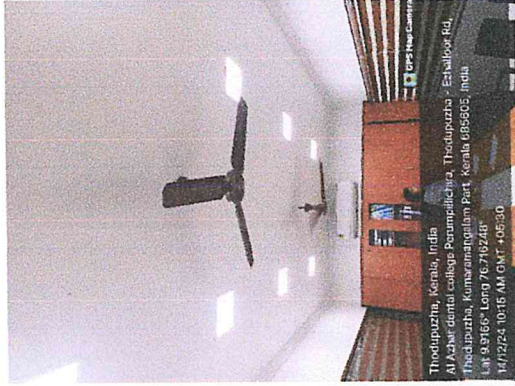
LED SENSOR LIGHTS