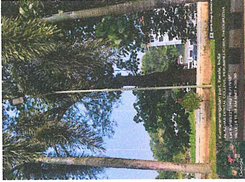
LED STREET LIGHT IN DENTAL COLLEGE CAMPUS