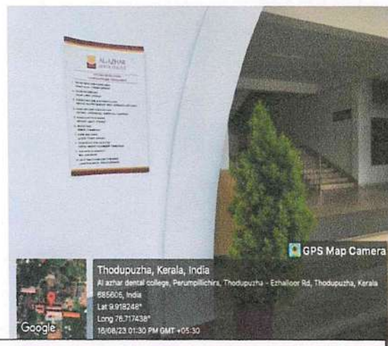
VISITOR INSTRUCTION DISPLAYED