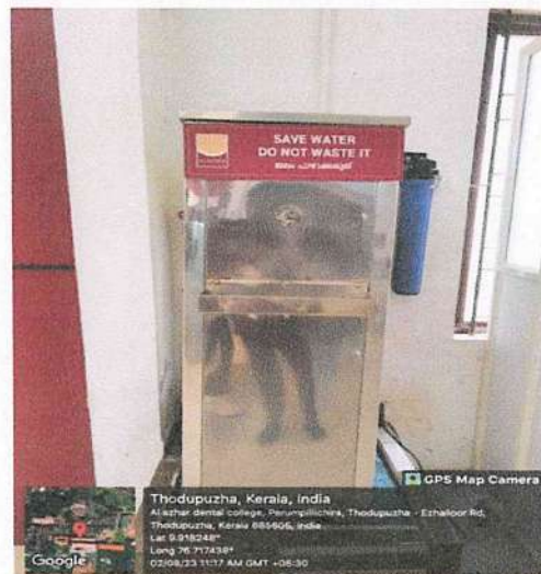
SIGNAGE ON WATER CONSERVATION